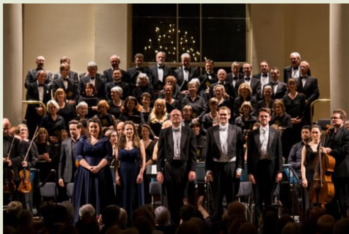
Receiving applause after our Schubert and Mozart concert