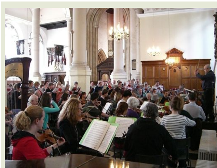
Come and Sing Brahms Requiem

St Margaret's was built in the latter part of the 11th century so that local people could receive all the sacraments and ministrations of the Church, whilst leaving the monks in Westminster Abbey undisturbed. The first church was Romanesque in style but by the end of the 15th century, it had fallen into such a state of dilapidation that it needed almost total reconstruction. Rebuilding started in 1482 and the church was consecrated in 1523. Despite restorations in the 18th, 19th and 20th centuries, the structure is still substantially the same. The parish of St Margaret's originally covered a large area. Consequently the registers of baptisms, marriages and burials are among the most extensive in London.