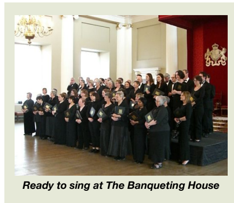
Ready to sing at The Banqueting House