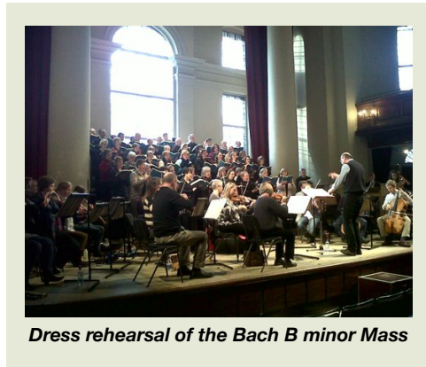
Dress rehearsal of the Bach B minor Mass

The programme for our celebration of 70 years of the Whitehall Choir at The Banqueting House could not be much more different from the Bach. A varied programme is always more difficult to rehearse, with its mixture of composers and styles. However, we have both the resources and the technical ability to master the music and I am sure we can take our positive mood and recent success at St John's forward to rise to this new challenge.